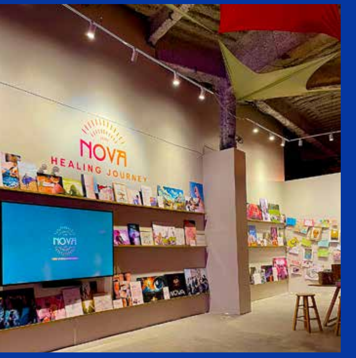
A behind-the-scenes look at The Moment the Music Stood Still, a special immersive exhibit dedicated to the Nova music festival